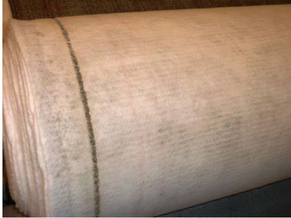
Figure 1. The SuperGroove on Bentomat.