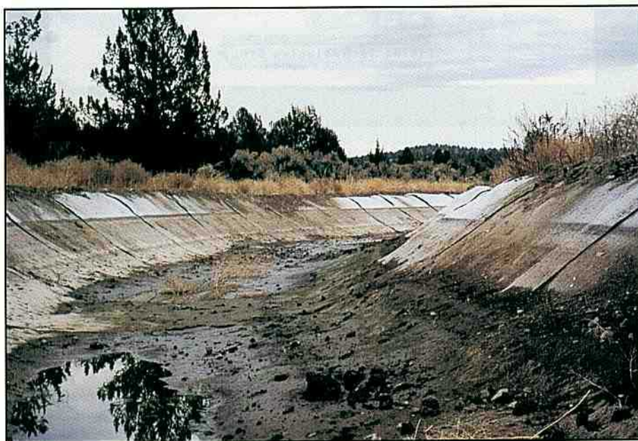
The canal was drained in November of 1999 and noticeable sedimentation has been observed in the uncovered section.

The installation of the GCL has been a success for the IID as it has eliminated the seepage in the toe of the bluff. IID has also measured reduced water levels in piezometers located downgradient of the canal berm. Table 1 (above) summarizes the decreased water levels in the three piezometers after 50 days of GCL installation.